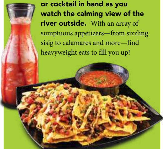
Pink Slush and Nacho Nasty

After a hard day's work, sit back and relax with a beer or cocktail in hand as you watch the calming view of the river outside. With an array of sumptuous appetizers—from sizzling sisig to calamares and more—find heavyweight eats to fill you up!