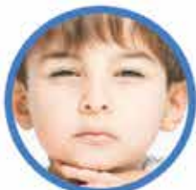
Squinting or covering one eye

Get your child's eye checked immediately when you notice any of these signs: