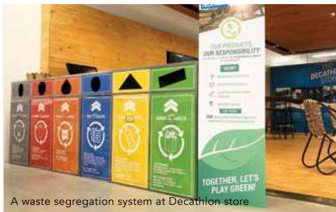
A waste segregation system at Decathlon store

Decathlon, as a socially and environmentally responsible company, believes in giving back to the community and in fulfilling one’s duty as a steward of the environment. As one of its sustainability and eco-efforts, Decathlon hosts regular eco-runs, wherein teams pick up trash along their running routes. Not only do they get to rev up their heart rate for the day’s cardio, but they’re able to exercise their duty of protecting the environment.