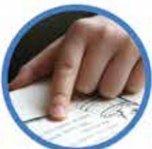
Using a finger to keep track of what they are reading