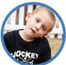
Tilting the head to one side