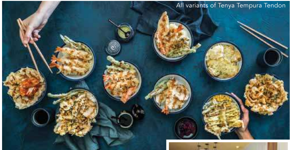
All variants of Tenya Tempura Tendon