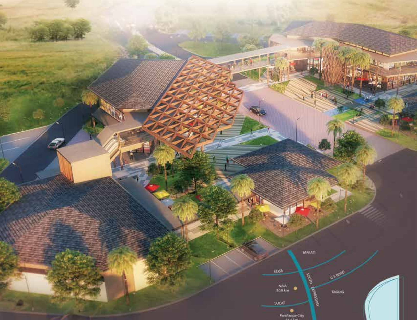
Artist's perspective of the Village Front

Live in a master planned community with the luxury of open space and a full suite of amenities surrounding your home for the redefined living experience.