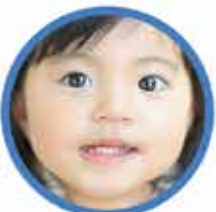
Having one or both eyes turn inward or outward