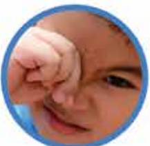
Rubbing eyes frequently