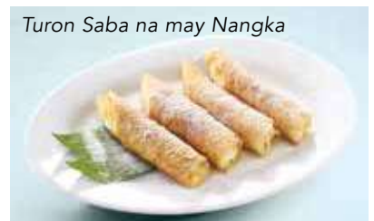
Turon Saba na may Nangka