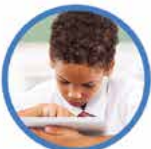
Holding materials close to the face