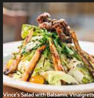
Vince's Salad with Balsamic Vinaigrette