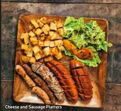
Cheese and Sausage Platters